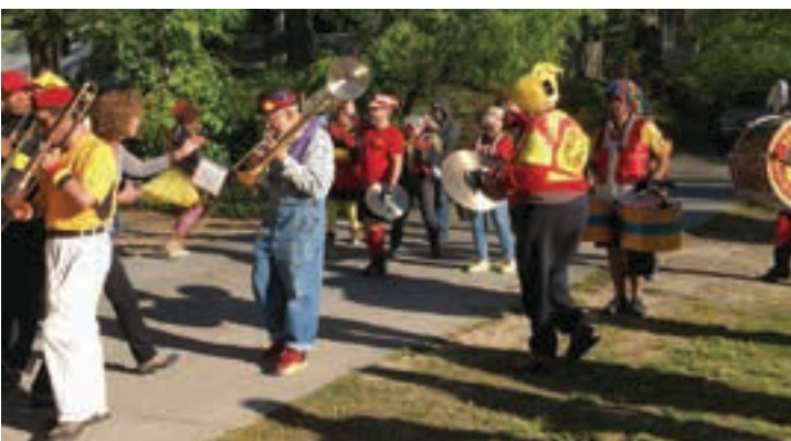
Marching Adominables