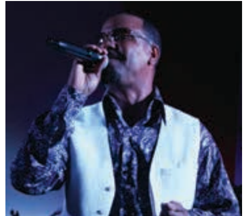
The lead singer of Bogey and the Viceroy