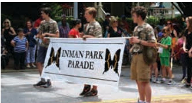
The Inman Park banner shows off in the parade