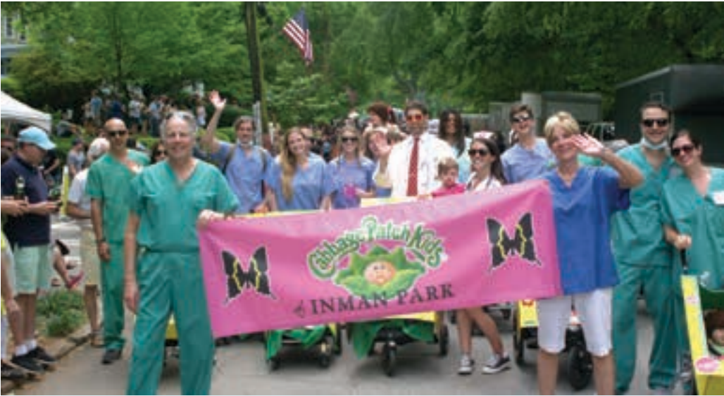
First Place Parade Winners: Cabbage Patch Kids of Inman Park.