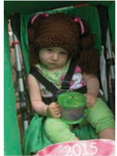
Cabbage Patch Kid Nina Saghafi